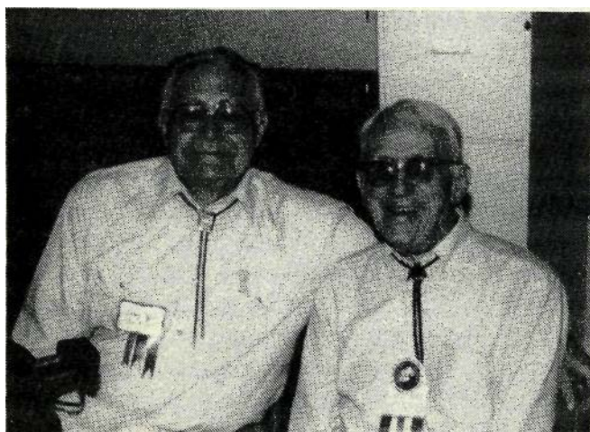
AT THE 1988 REUNION.