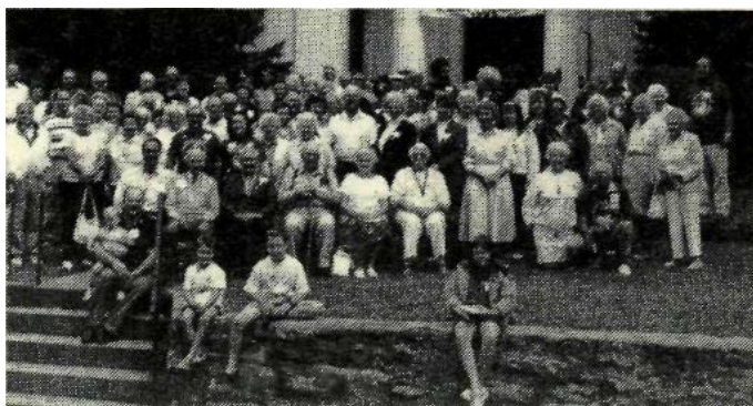
1992 FAMILY PORTRAIT

At a meeting earlier this year, the Trustees became aware of a book called Apgars Since the Civil War. It was purchased and found to be nothing more than a listing of 20,000 names taken from various telephone books. Members were warned to stay away from this kind of scheme, and if anyone had any questions about a purchase of this type, to contact the one of our officers or trustees for information. It was also suggested that, now that we had made that investment in a list of names, that we use it as part of a membership drive