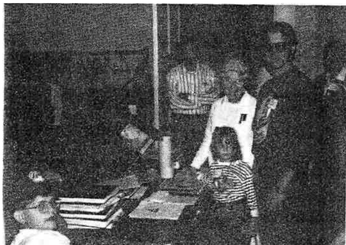
The Historian's table is always busy at the Apgar Reunion.