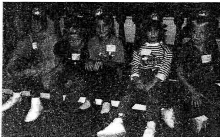
The next generation showing off their new Apgar hats at The 1993 reunion