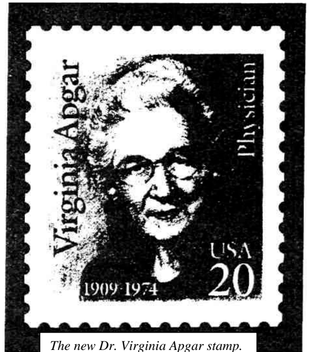
The new Dr. Virginia Apgar stamp.