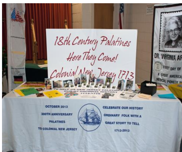
18th Century Palatines Table