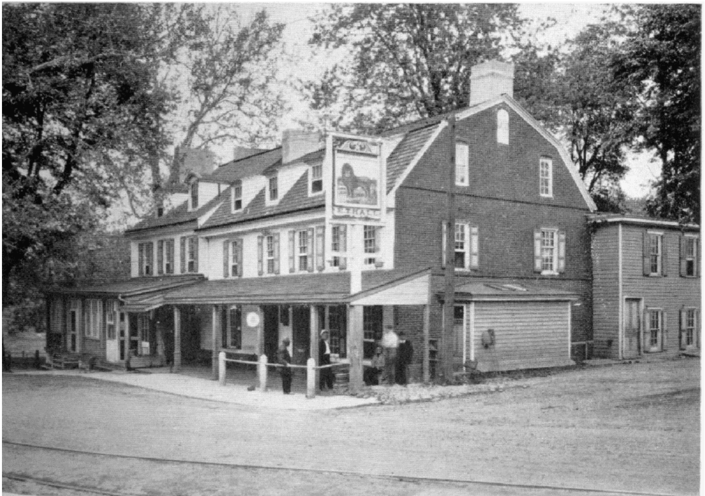
Red lion Inn (Second and Noble Street) Philadelphia