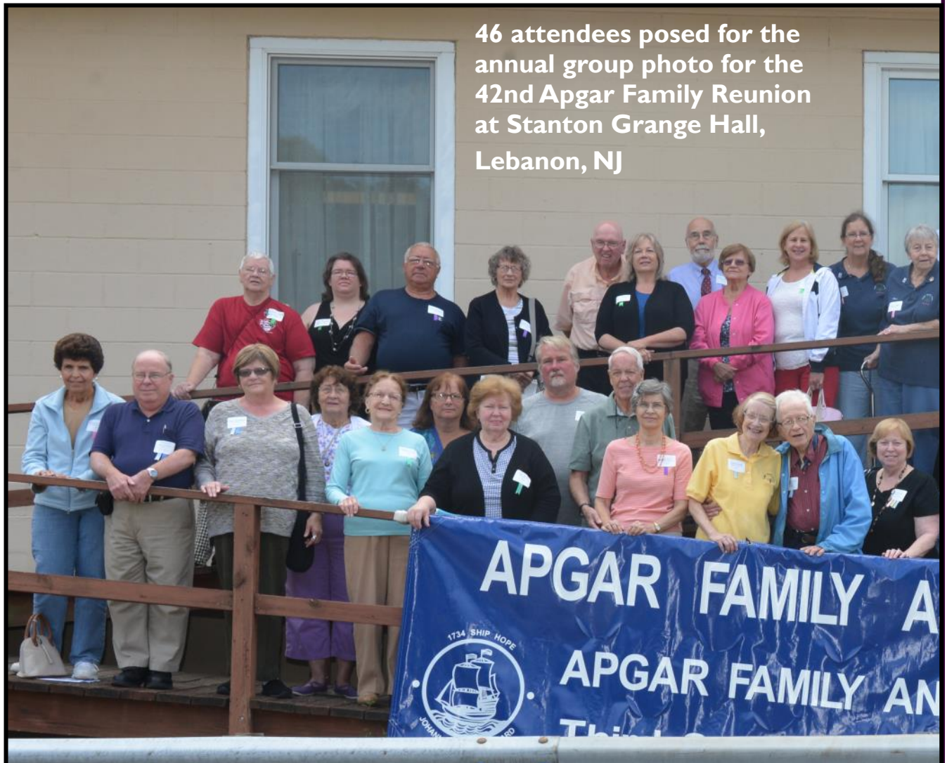
46 attendees posed for the annual group photo for the 42nd Apgar Family Reunion at Stanton Grange Hall, Lebanon, NJ