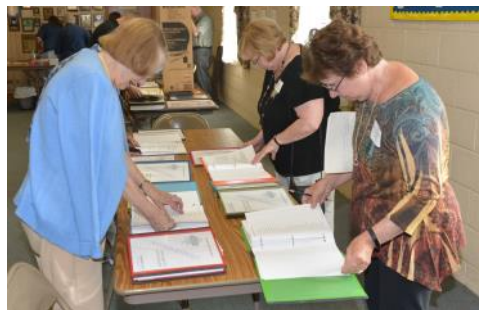
Members at the 2016 reunion doing just that: